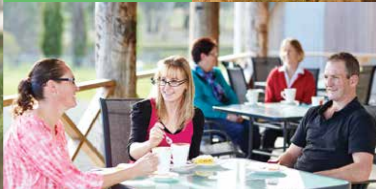
Alfresco dining at the Bunyip Hotel with views of the Wannon River