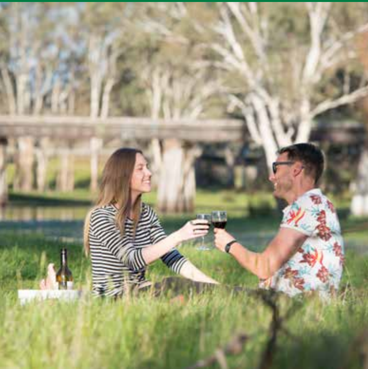
Enjoy peace and tranquil riverside camping

Enjoy the views of the river and the recently restored trestle bridge from the back verandah of the community owned art deco Bunyip Hotel, with a cool ale close by of course, or walk along the banks of the Wannon River and enjoy lunch at the Bridge Cafe.