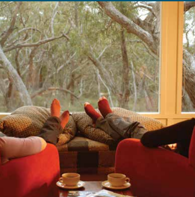
Award-winning accommodation, food and wine

We embrace the use of social media, so please use #dunkeldvic and #visitgreaterhamilton when you are here to give us permission to repost.