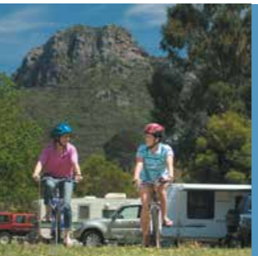
Cycling and bushwalking at the base of the Southern Grampians