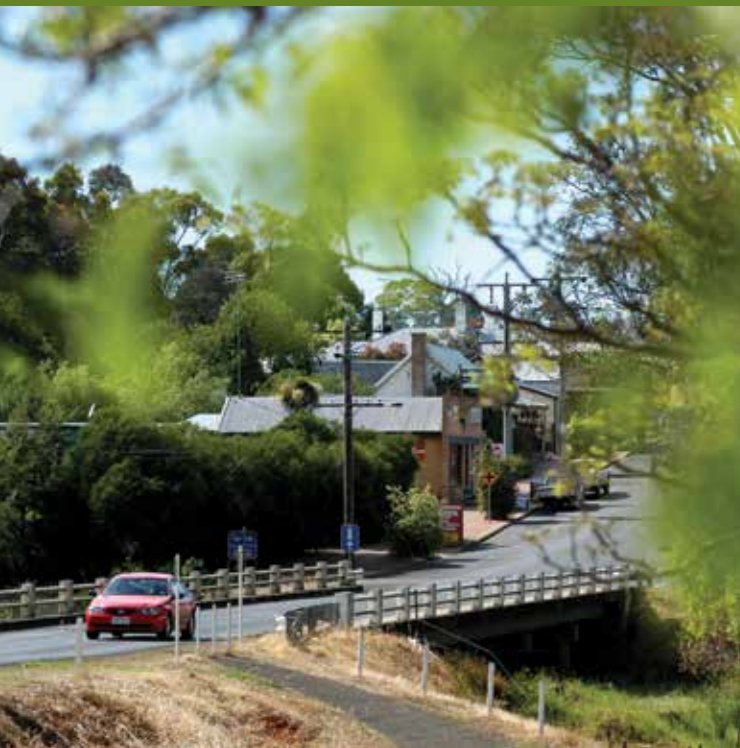
The Balmoral Show, held annually in March, was established in 1887

Balmoral has something for everyone – history, the arts, camping, golf and outdoor activities, family getaways, farm stays - and a warm welcome.